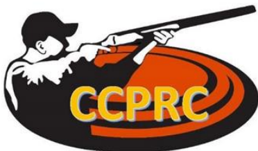
Corpus Christi Pistol & Rifle Club, Est. 1938

Please visit www.corpuschristigunclub.com for more information on what the club has to offer.